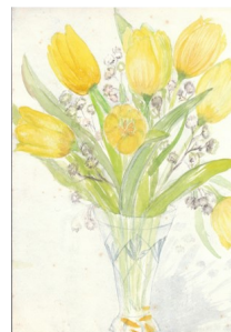
"Tulips" A Painting by Mollie Nye